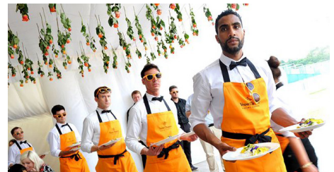
Chefs and Catering